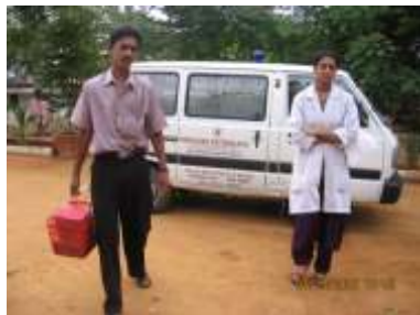
Representatives from Eye Bank