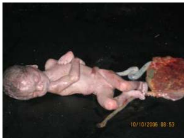
Delivered a near full term baby