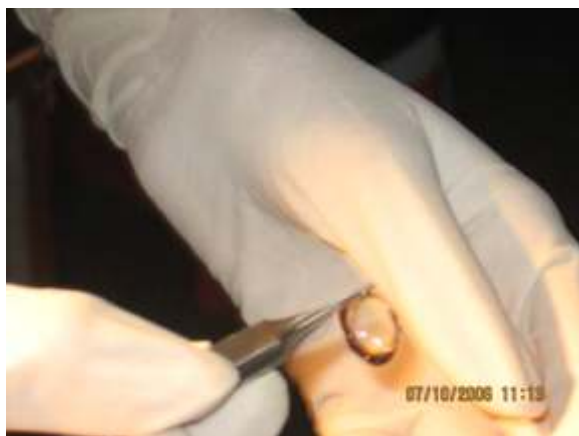
Eye Lens will be used for others in need