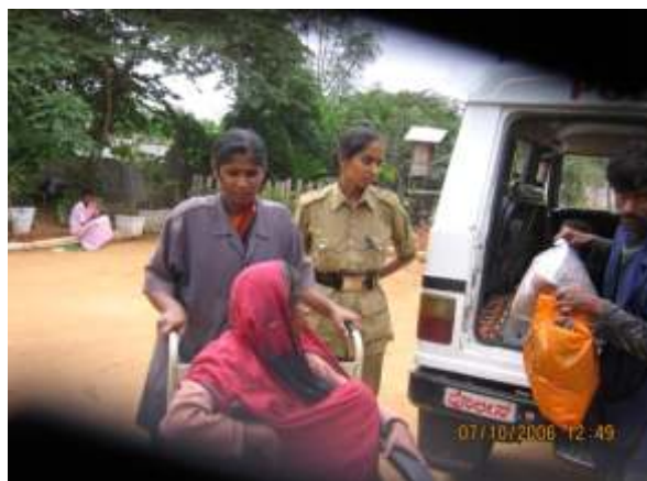
Unidentified woman dropped off by Police